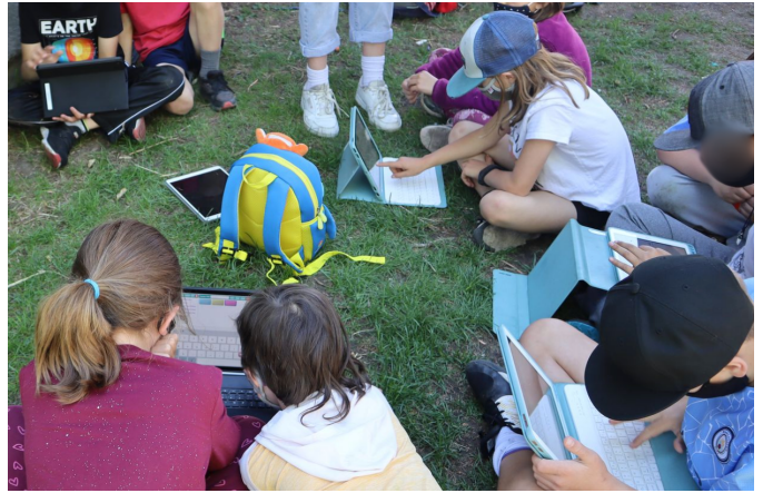
Fig. 3. Workshop participants sat outside together and designed interactions buttons to test on their robot body prototypes.

Because our goal was to facilitate critical reflection, our analysis was centered on children’s thought processes and sense-making procedures, not their actual designs. The design process was an accessible, creative way to support children’s conversation and encourage exploratory thinking. Additionally, we do not claim that the content of our participants’ designs is generalizable. We discuss this choice more in section VI-D.