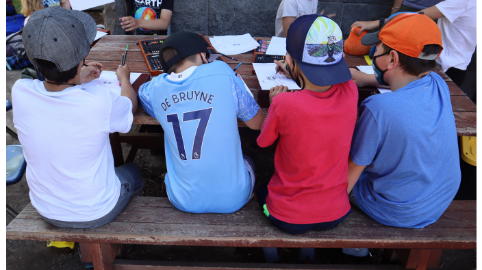
Fig. 1. In this paper, we explore how co-design workshops can evoke children’s perspectives on robot relationships and the ethical concerns they present—a key requirement for designing technologies whose stakeholders include children.

Human Robot Interaction researchers are creating interactive robotic technologies for children, especially in the contexts of education [3, 4] and healthcare or therapy [5, 6, 7]. While there are clear prosocial reasons for developing technologies to assist children, there are also clear ethical risks to these technologies—especially with respect to the relationships children may form with robots [8, 9, 10]. Child Robot Interaction researchers have a duty to understand how children make sense of robotic technologies and develop positions towards these associated risks, and to incorporate those positions into their